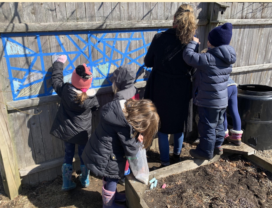
Decorating the fence